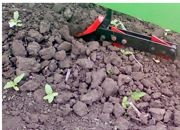
Fig. 5. Formation of a leading crack with a chisel of the new asymmetric working body of a fallow cultivator.

Therefore, the higher the speed of the movement of a standard V-shaped sweep, the less time the soil is subject to crumbling, which is accompanied by a decrease in its crumbling quality.