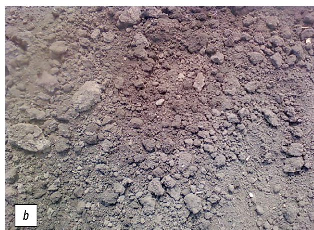
Fig. 4. Ground after tillage by working bodies: a — the new asymmetric working body of a fallow cultivator; b — the standard V-shaped sweep.