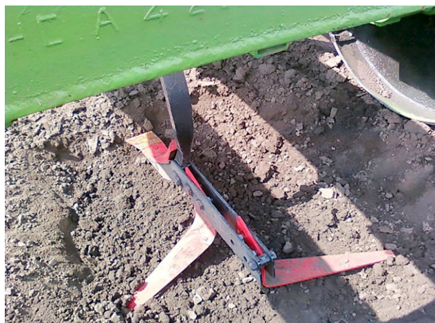
Fig. 1. New asymmetric working body of a fallow cultivator. Рис. 1. Новый асимметричный рабочий орган парового культиватора.

At Donskoy ANC, in the department of mechanization of crop production, a novel asymmetrical working body of a fallow cultivator has been developed. The new working body comprises a stand with a chisel and left- and right-handed blade cultivators installed on it sequentially (Fig. 1).