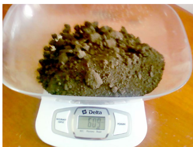
Fig. 3 Weighing of the full soil sample.

This confirms the instability of the stroke depth of a standard V-shaped sweep when operating in these