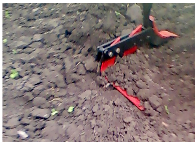
Fig. 6. Soil crumbling with flat-cut rippers of the new asymmetric working body of a fallow cultivator.

Рис. 5. Формирование опережающей трещины долотом нового рабочего органа парового культиватора.