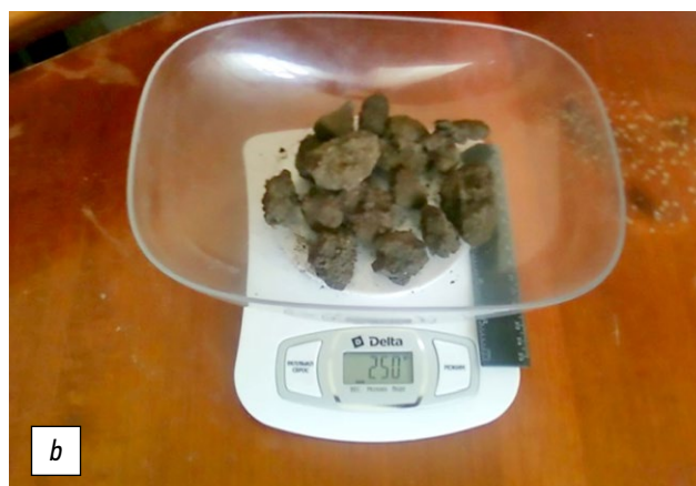
Fig. 2. Selection and weighing of lumps larger than 25 cm.

Рис. 2. Отбор и взвешивание комков, размер которых превышает 25 см.