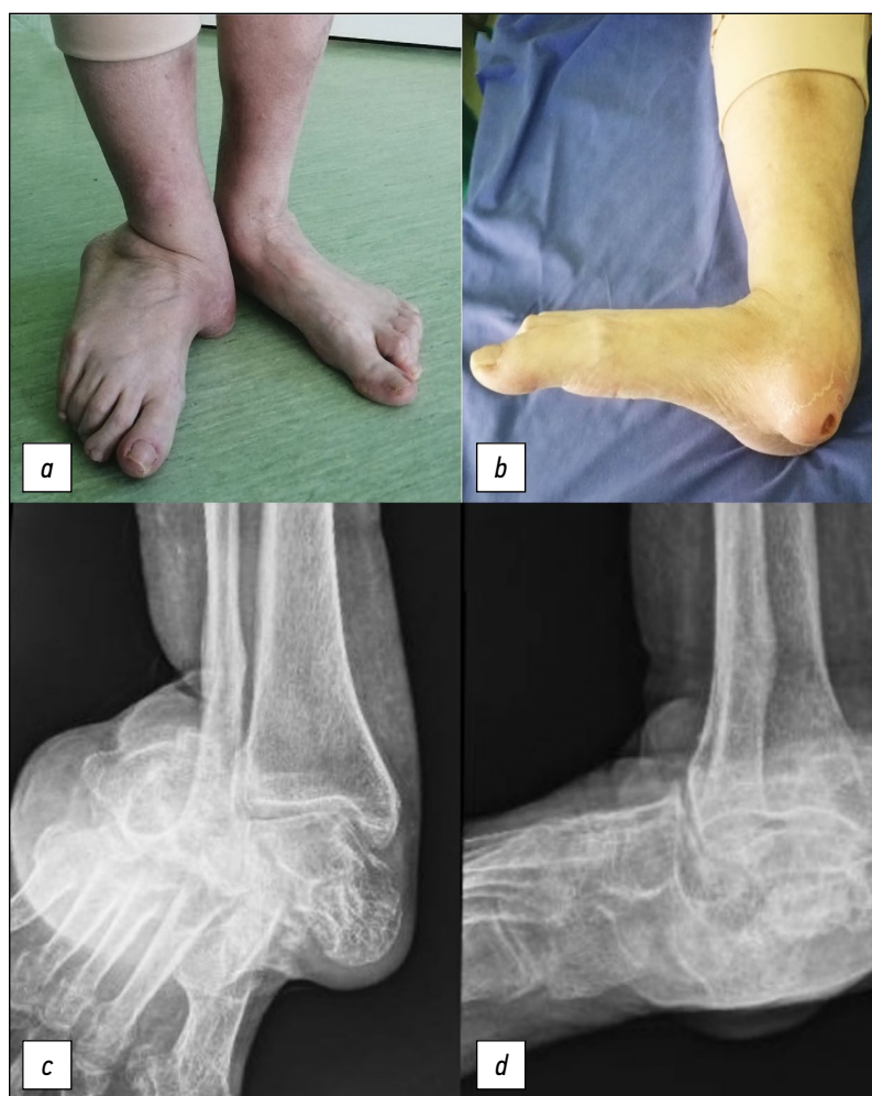
Fig. 1. Clinical image and plain radiography at presentation: anteroposterior ( a and c ) and lateral ( b and d ) views.

A 55-year-old female patient with rheumatoid arthritis, asthma, and hypertension was referred to the specialist orthopedic clinic by her primary physician due to a 12-month history of progressive right ankle pain and challenges with walking. She denied any history of recent trauma to the affected ankle. Notably, she was diagnosed with acquired flatfoot more than five years ago, which had since deteriorated, resulting in chronic deformity of the left foot and ankle. Upon examination, she exhibited an antalgic gait with signs of discomfort. Although no neurovascular abnormalities were detected, her left foot and ankle demonstrated a pronounced valgus deformity. Notably, the severe valgus deformity caused pronounced skin tension over the medial malleolus, accompanied by skin atrophy and ulceration (Fig. 1). Plain radiographs revealed gross sclerosis and disorganization of foot bones, with medial dislocation of the tarsus, as well as