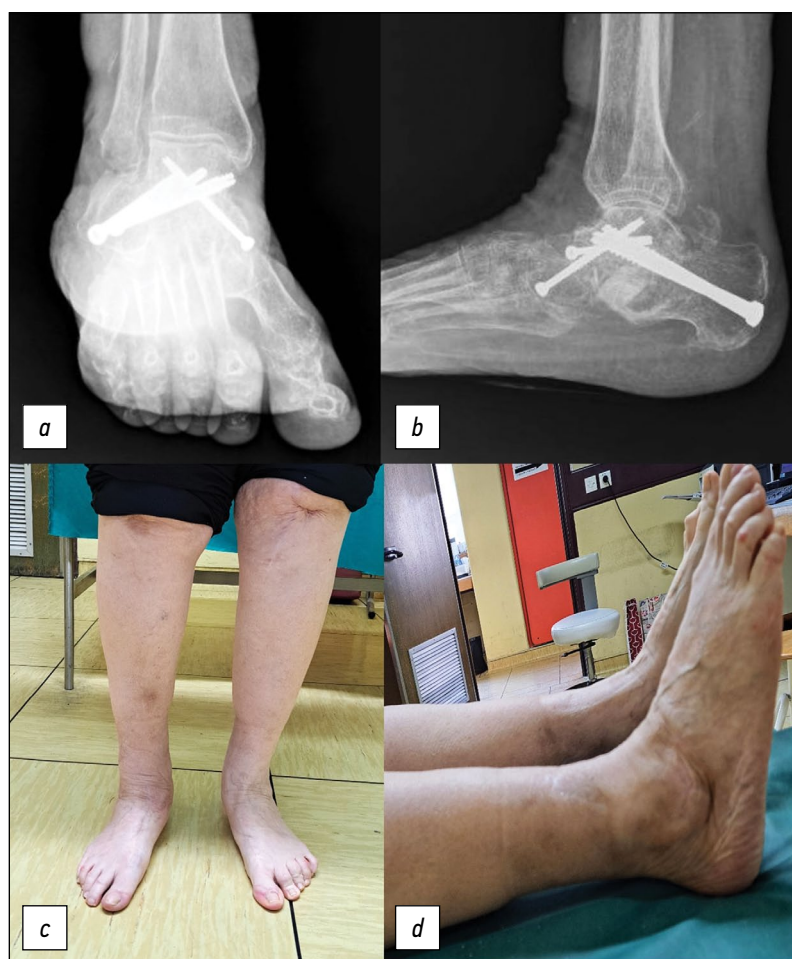
Fig. 3. Plain radiographs and clinical images six months following the procedure: anteroposterior ( a and c ) and lateral ( b and d ) views.

Рис. 3. Обзорные рентгенограммы и клиническая картина через 6 месяцев после вмешательства: передне-задний ( a и c ) и боковой ( b и d ) вид.