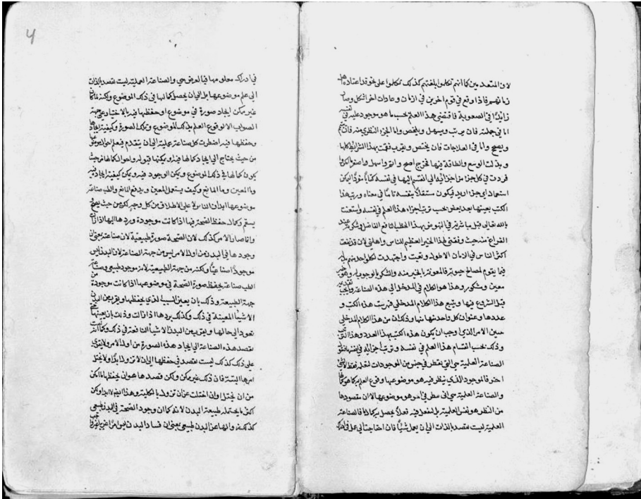
Pl. 2. SPbSU Scientific Library, Ms.O 667, f. 3b-4a

Following this, the author sets himself the task: “The knowledge contained in the theoretical part of medicine must be supplemented and corrected, and the information constituting its therapeutic part must be rendered in a simpler and more concise form” (f. 3b). The author writes about accomplishing this task: “[In my work] I have accomplished all the tasks listed, making every possible and available effort to do so. As the result, it is more accurate, perfect, simple, and more concise. I [have set apart] in a separate book each of the sections of the art [into which] 16 it is divided, so that it may be used alone and may exist independently and be complete in meaning. I [have arranged] 17 these books one after another in the order in which the sections are arranged in the science itself” (f. 3b).