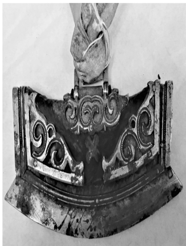
Pl. 2. Flint box. MAE RAS. Collection inventory MAE № 197-2