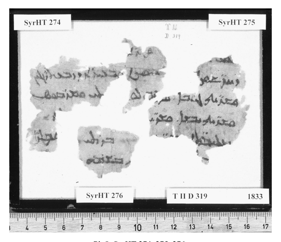
Pl. 8. SyrHT 274, 275, 276.

A case can be made for connecting the scroll now in the Hermitage with three Syriac fragments in the Berlin Turfan Collection (Staatsbibliothek zu Berlin — Preußischer Kulturbesitz), glassed together and assigned the new signature numbers SyrHT 274, SyrHT 275 and SyrHT 276. The visible text and translation are as follows (they are affixed to yellow pasteboard, so there is no verso, as is the case with the Hermitage scroll).