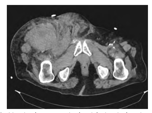
Fig. 2. Massive hematoma in the right inguinal region and thigh after percutaneous coronary intervention (author's case)

(0.5%-9%), and emergency surgery is indicated in this case. When performing postoperative compression, the size of the tool used to catheterize the vessel should be considered. The compression force should be approximately 20 mmHg above the systemic systolic pressure. The reference points in Table 2 can be used to determine the compression time.