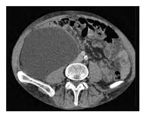
Fig. 4. Giant lymphocele (> 2.5 L ) after evacuation of a retroperitoneal hematoma (author's case)

When using tools larger than 6 Fr in diameter for arterial access, the use of a suturing device is recommended. In the early postoperative period, strict adherence to bed rest by the patient and control of the puncture site by the department staff are of key importance.