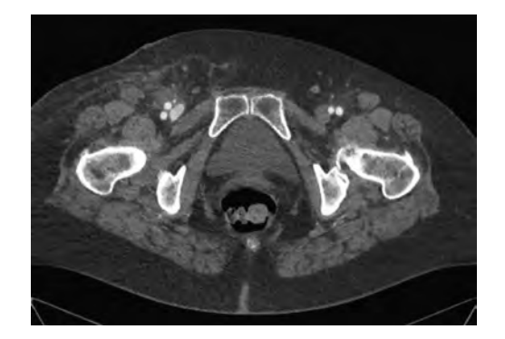
Fig. 5. Post-intervention arteriovenous fistula. The arrow indicates contrasting of the femoral vein (author's case)

5. Mansour M, Karst E, Heist EK, et al. The Impact of First Procedure Success Rate on the Economics of Atrial Fibrillation Ablation. JACC: Clinical Electrophysiology. 2017;3(2):129–138. DOI: 10.1016/j.jacep.2016.06.002