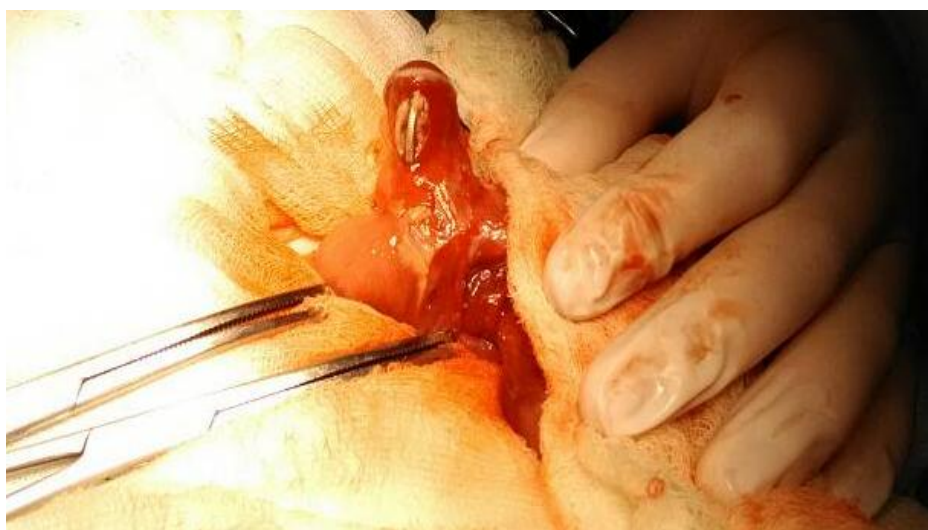
Fig. 2. Intraoperative photo of Meckel's diverticulum with a foreign body (a coin)

was dissected away on clamps, sutured, ligated to both sides with lavsan. Appendectomy was performed with placement of the stump into the cupula of cecum with purse-string and Z-shaped suture. Resected appendix was sent to histological examination. In the course of the operation hemostasis was conducted, control of hemostasis – dry. Sanitation of the abdominal cavity, effusion was dried up. Layer-by-layer complete closure of the wound. Wound cleaning. Aseptic bandage.