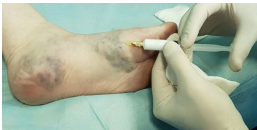
Fig. 2. Microfoam scleroobliteration in diffuse lesion of the foot.