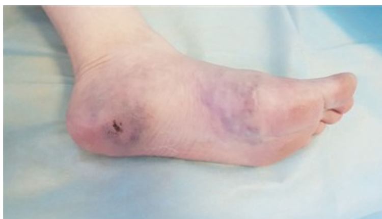
Fig. 4. Result of scleroobliteration in three months (after two sessions). Significant volume reduction in the pathological venous caverns.

Satisfactory results (significant relief of pain and obliteration of venous caverns, as shown in Figure 4) were achieved in 10 patients (Table 2).