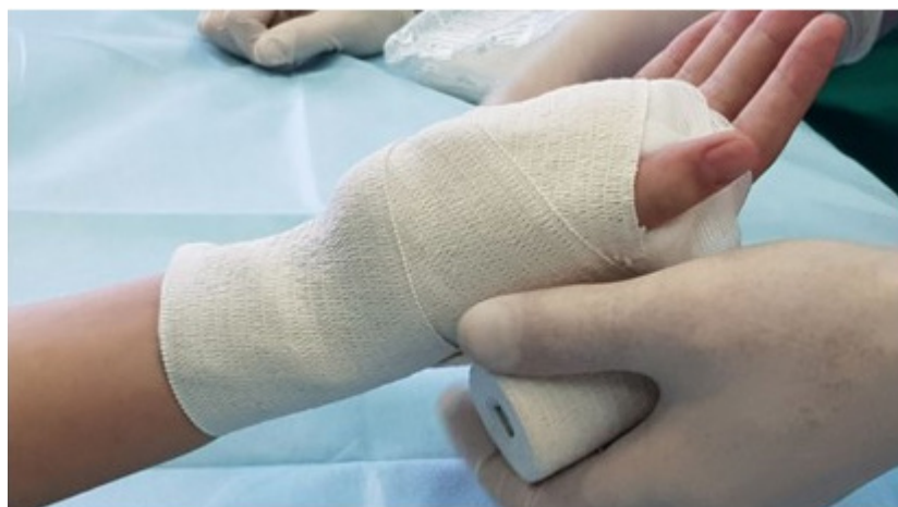
Fig. 3. Compression with elastic bandages with a low degree of distensibility after scleroobliteration of the local venous caverns of wrist.

Immediately after the introduction of the sclerosant, a significant pain was felt at the site of drug introduction, which regressed by the time the procedure was completed. Afterward, compression with elastic bandages of a low degree of distensibility was performed (Figure 3).