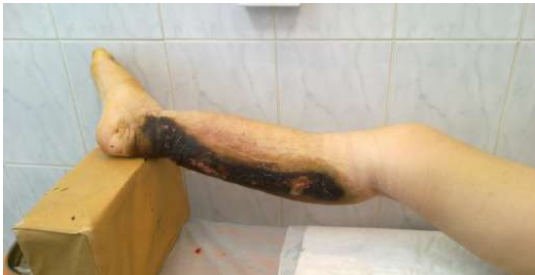
Fig. 4. Condition of the lower limb of the patient on the third day after the operation of dermalipofascioectomy

The patient was discharged on the 23 d day after the operation with the recommendations of supportive conservative treatment: wearing of the 3 d degree compression garments, protractive systemic multienzyme therapy (Wobenzym 3 tablets 3 times a day for 3 months). On examination 6 months later the condition of the patient was satisfactory. Reduction in the functional insufficiency of the affected limb and improvement of the quality of life were stated. The patient felt reduction in the heavy feeling in the leg and significant relief in walking. In volumetry, the volume of the right lower limb was 9477 cm 3 , and of the left – 5536 cm 3 . Parameters of computed tomography indicated reduction in the thickness of soft tissues of the shin to 26 mm with preservation of the density at the level of 36 HU.