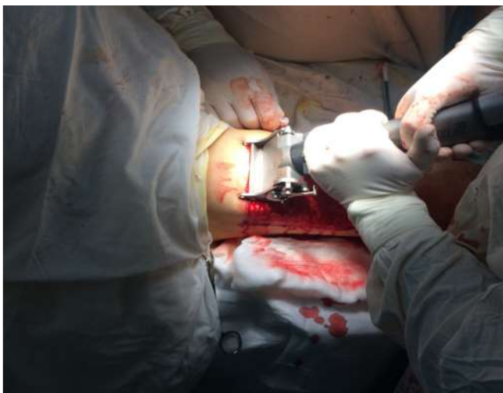
Fig. 3. Use of Acculan 3Ti (GA 670) dermatome in the operation of dermalipofascioectomy

of mono- and bipolar electrocoagulation. In the operation at the stage of elimination of fibrotically changed tissues Acculan 3Ti (GA 670) dermatome was used with control of thickness in the range 0.2-1.2 mm and of width in the range 8-78 mm (Fig. 3). Intraoperative loss of blood and lymph was 800 ml and was compensated for with crystalloid, colloid solutions and fresh frozen plasma in the volume of 600 ml. Active drainage of the region of the postoperative wound was conducted by Redon method within 10-12 days.