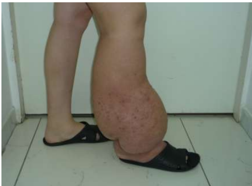
Fig. 1. View of lower limbs of a 33 year old female patient with IV stage primary lymphedema of the right lower limb before the operation

showed normal patency of the deep and superficial veins and consistency of their valvular apparatus. Signs of diffuse enhancement of echogenicity of the soft tissues of the limb with separate areas of reduced echogenicity were found. Multispiral computed tomogra-