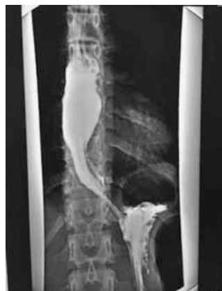
Fig. 3. X-ray image of the esophagus 1 month after the surgery

Рис. 3. Рентгенограмма пищевода через месяц после операции