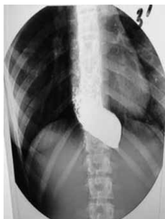
Fig. 2. X-ray image of the esophagus prior to the surgery

Рис. 2. Рентгенограмма пищевода до операции