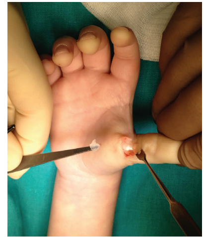
Fig. 4. Surgery stage: annular ligament is excised, and a node on the long first finger flexor tendon is determined