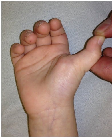
Fig. 2. External appearance of the hand in a child diagnosed with stenotic ligamentitis of the first finger of the right hand