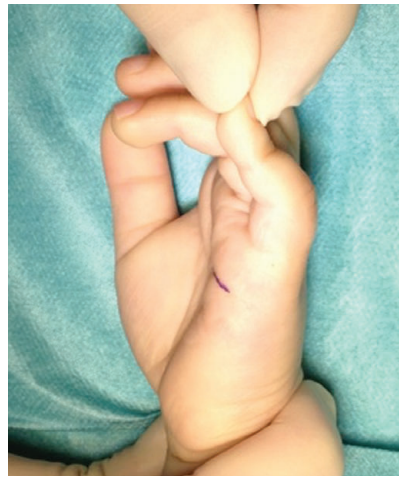
Fig. 3. External appearance of the hand in a child diagnosed with stenotic ligamentitis of the fifth finger of the right hand