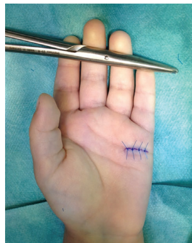
Fig. 6. Result of the surgery: deformity removed