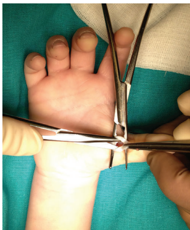
Fig. 5. Surgery stage: spindle resection of the central portion of the long first finger flexor tendon