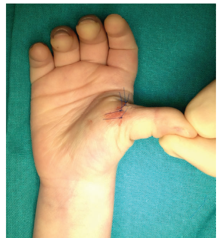
Fig. 7. Result of the surgery: deformity removed