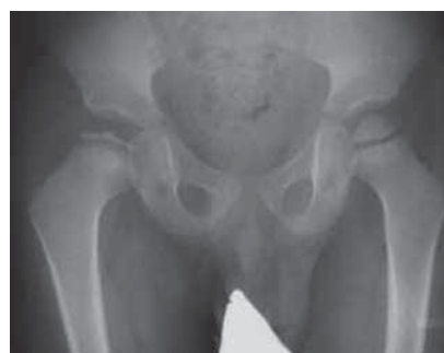
Fig. 2. X-ray picture of the hip joint in the antero-posterior projection of patient T., 5 years old. The diagnosis on the right side is Perthes disease, stage III. Total lesion of the proximal epiphysis of the right femur